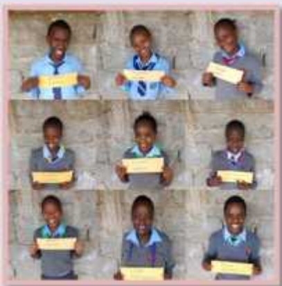
Our Transition Team 2017

Ladies and gentlemen we are excited to introduce the Transition House Project to the glory of our God! Catch updates on the progress of this project in our next edition of our monthly newsletter at the end of September. We also look forward